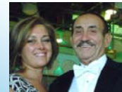
My father is 85